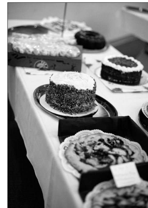
CONTINUED ON PAGE 5 The dessert dash was tempting!